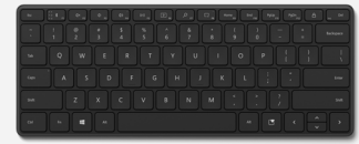
Microsoft Designer Compact Keyboard