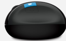
Microsoft Sculpt Ergonomic Mouse