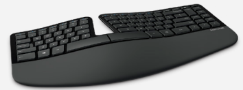
Microsoft Sculpt Ergonomic Keyboard