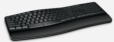
Microsoft Sculpt Comfort Keyboard